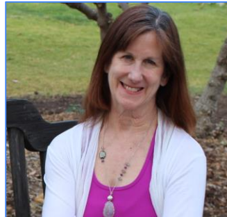
Consulting Group: Mindful Strategies, Inc.